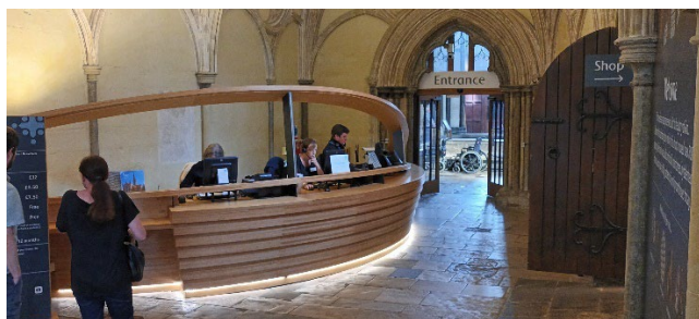
The Welcome Desk showing access into the Cathedral and into the Cathedral shop