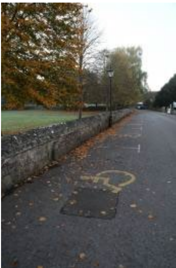
Example of the disabled parking spaces within the Cathedral Close