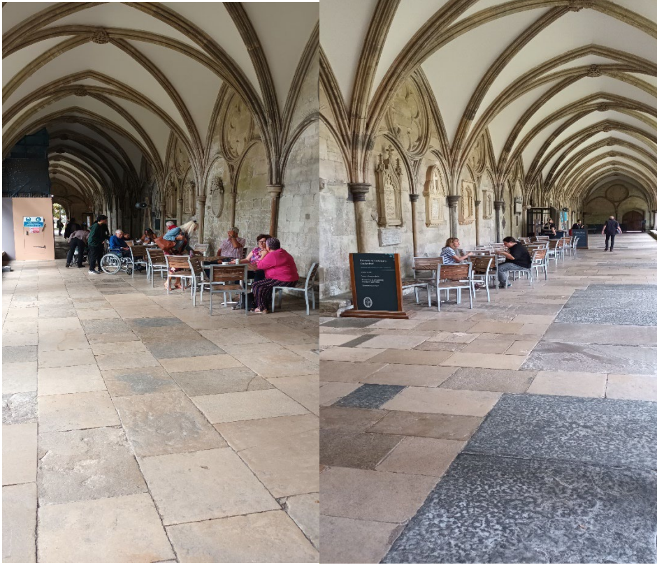
Additional seating outside The Refectory in The Cloisters