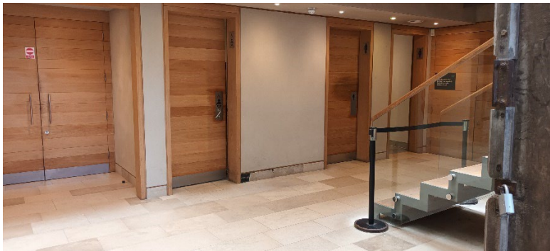
Area outside of the public toilets