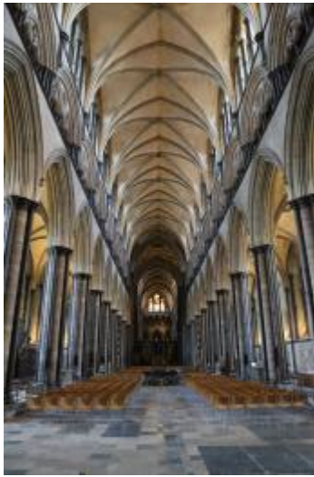
A view of the Cathedral Nave