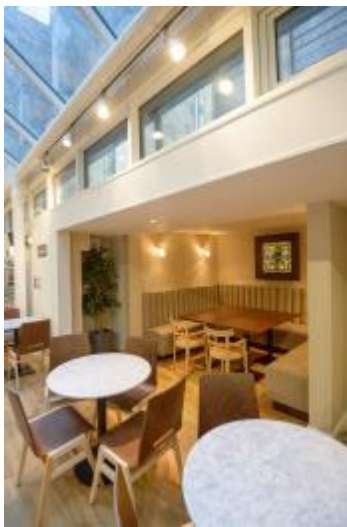
Seating in the Refectory