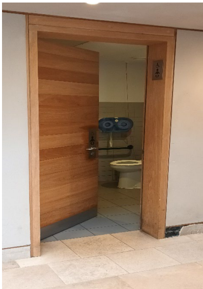
Disabled toilet 1