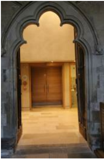
Entrance to the public toilets