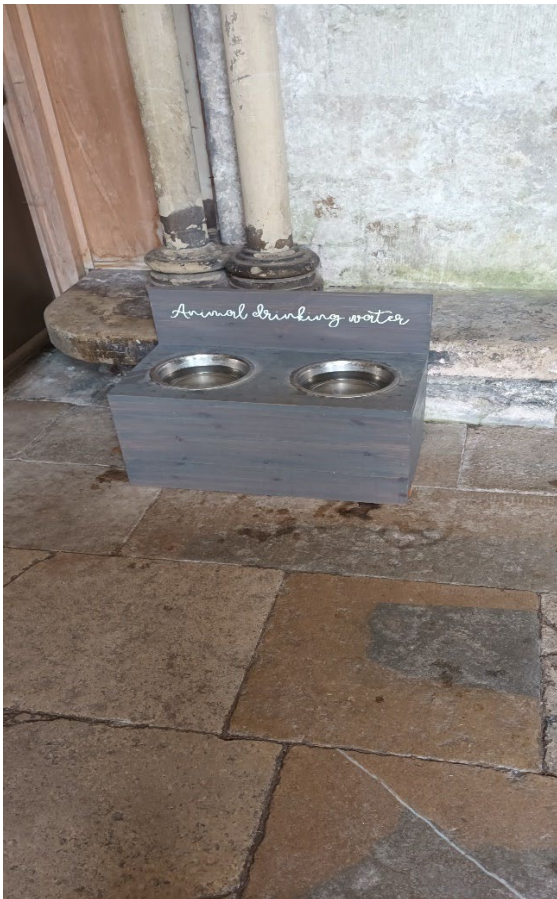
Dog Bowls in The Cloisters, next to the visitor's entrance.