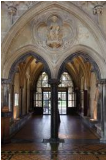
Inside The Chapter House looking back into The Cloisters