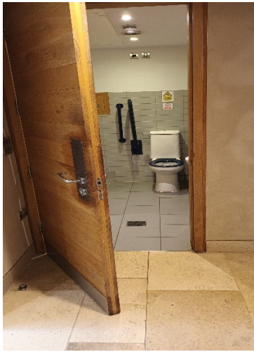
Disabled toilet 2