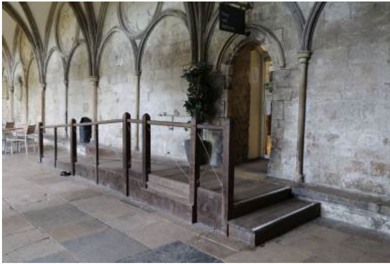
Access to The Refectory from The Cloisters