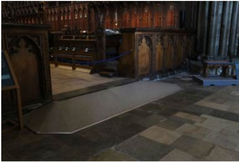
The ramp leading into the Choir Stalls