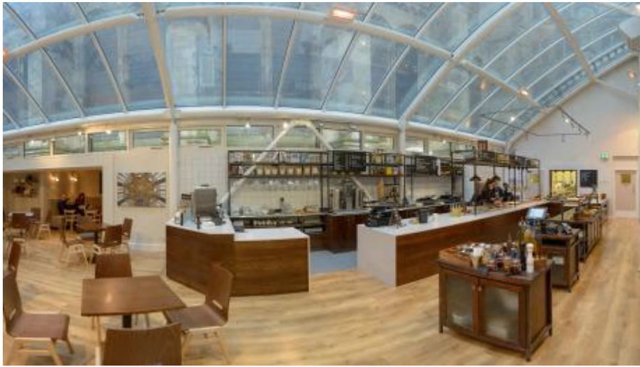
Fisheye view of the Refectory