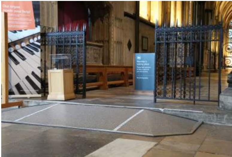
Ramped access to the North Choir Aisle which leads to The Morning Chapel and the Trinity Chapel