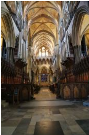
The Choir Stalls