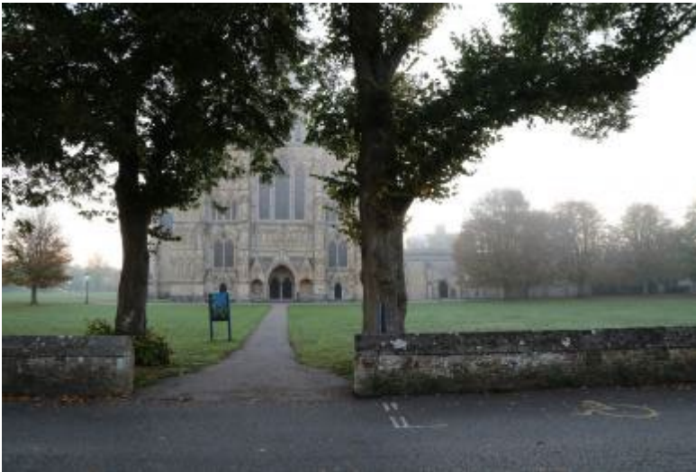
Showing the pathway from the disabled parking to the main entrance

There are numerous quiet seating areas within the Cathedral Close, with benches situated on the lawns around the Cathedral.