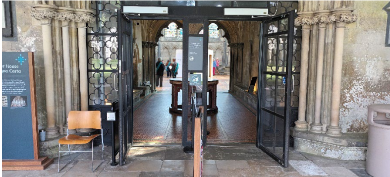
The entrance to The Chapter House