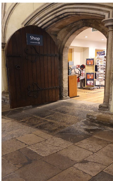
The entrance to the Cathedral Shop accessed via the main entrance