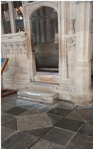
Stepped entrance to The Audley Chapel.