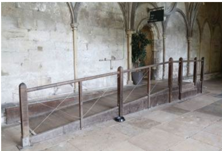
The ramp leading into The Refectory